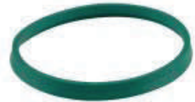
Drum Valve Coupler Main Gasket * EPDM: 102-067 Viton: 102-068 Aflas: 102-078

* Other seal materials available on request