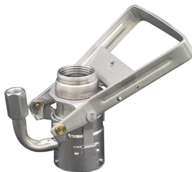
DV Coupler vapour-recovery