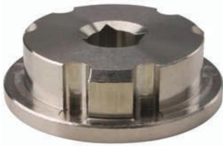
Drum Valve Installation & Removal Tool 741-015

Used to install and remove the Drum Valve from drums and IBCs