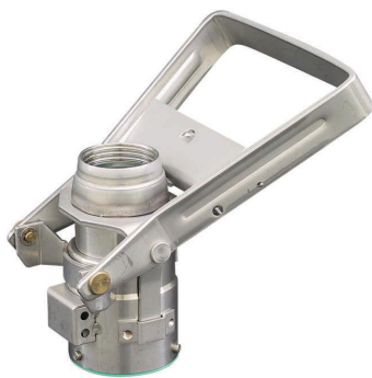
DV Coupler self-venting