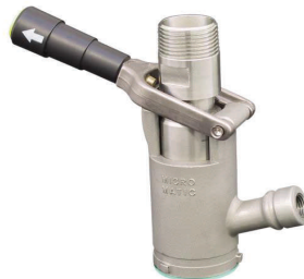
Heavy Duty Coupler*