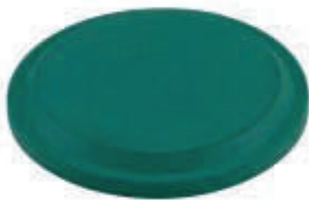
Drum Valve Coupler Probe Seal * EPDM: 102-073 Viton: 102-074 Aflas: 102-076