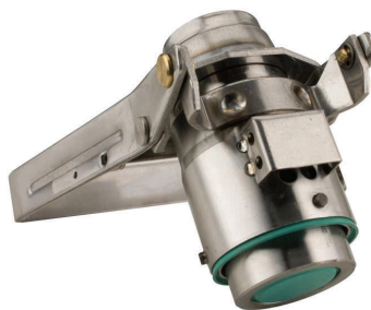
DV Coupler 1800