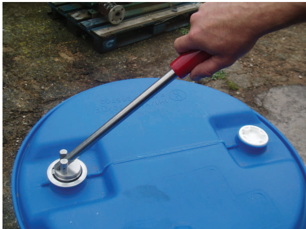
Drum Valve De-Clinching Tool

Used to install the clinch ring on the Drum Valve