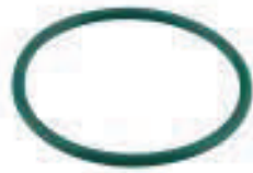
Drum Valve Coupler Body O-Ring * EPDM: 102-061 Viton: 102-062 Aflas: 102-064