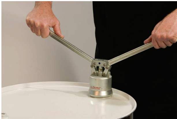
Drum Valve Crimping Tool

Used to disassemble and reassemble Drum Valve for repair