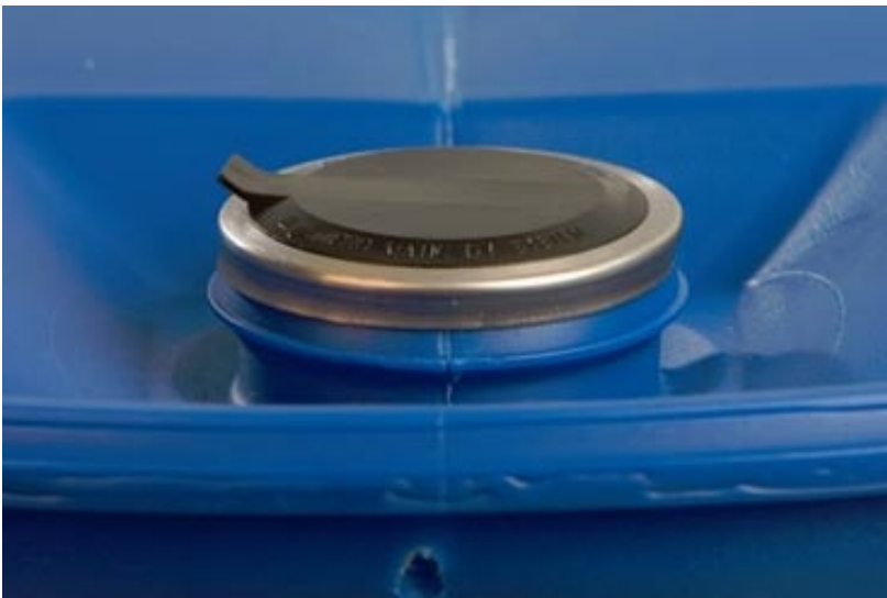
56x4 plastic drum with Clinch Ring and Tamper Evident Cap.