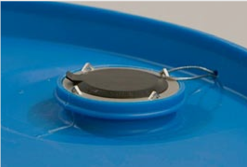
2.5x5 plastic drum with Tamper Evident Wire and Tamper Evident Cap.