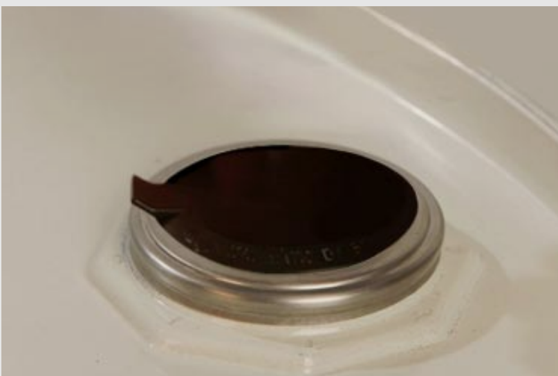
2" BSP steel drum with Clinch Ring and Tamper Evident Cap.