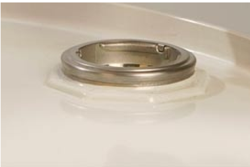
2" BSP steel drum with Clinch Ring.