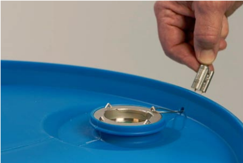
2.5x5 plastic drum with Tamper Evident Wire.